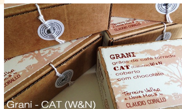
Grani - CAT (W&N)